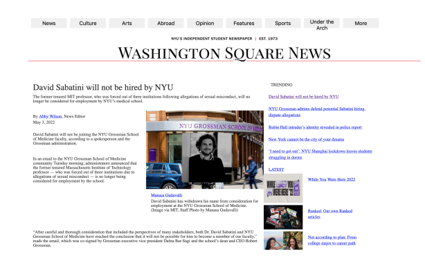
Figure 5: Corresponding MAML Page

To produce a fair comparison of loading time, as the MAML pages are served from a server in New York University Abu Dhabi, the original webpages are cloned and hosted on a proxy server at the university. Firefox browser was used to inspect the loading time of webpages, with caching disabled.