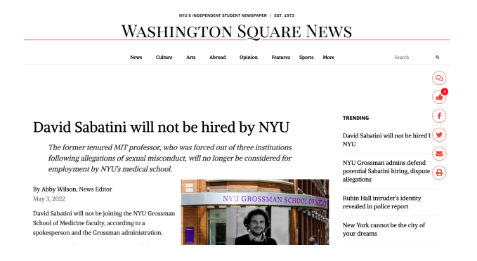
Figure 4: An Existing Webpage

To compare the loading time of the MAML pages with existing webpages, we chose 20 existing webpages to create MAML pages that have similar content and style. Given the limited functionalities supported by the MAML editor, we ended up creating 17 MAML pages that are able to produce most of the content of the original webpages.