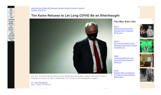
Figure 2: Creating a Page Using the Editor

which cannot be reassigned to new component instances even if an old component instance is removed from the editing area. This helps prevent errors that may arise due to duplicate component instance IDs.